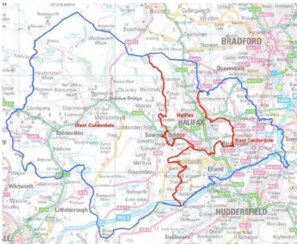
Figure 2– Economic Markets within Calderdale